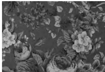
[ fabric ]