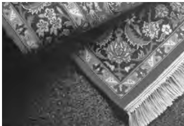
[ area rug ]

Hypoallergenic when dry. Not harmful to infants or pets. Exceptional oil and water base soil and stain protection. Keeps carpet and upholstery looking newer, longer. Nontoxic.