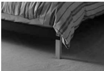
[ metal legs ]

Fast-acting formula. Nontoxic. Biodegradable.