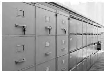
[ file rooms ]