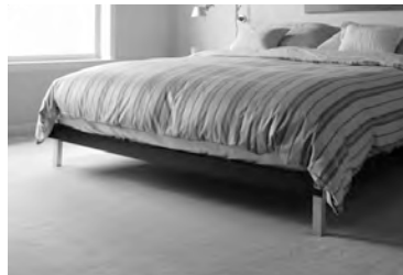
[ carpet ]